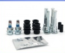
Brake Repair Kit