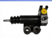
Brake Slave Cylinder