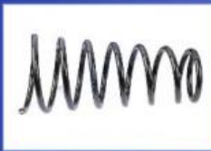
Shock Absorber Spring