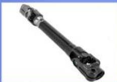
Steering Column Shaft