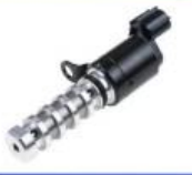
Oil Control Valve