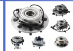
Wheel Hub Bearing