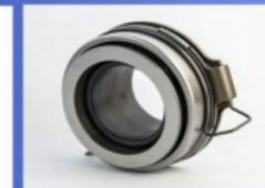
Clutch Release Bearing