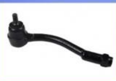
Tie Rod End