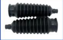
Steering Gear Boots