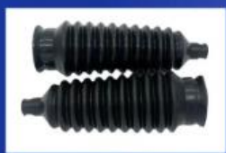
Steering Gear Boots