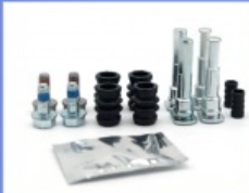
Brake Repair Kit