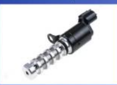
Oil Control Valve