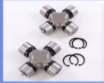
Universal Joint Bearing