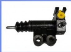
Brake Slave Cylinder