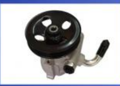
Power Steering Pump