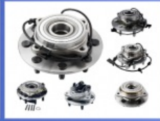
Wheel Hub Bearing