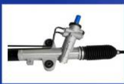
Power Steering Rack