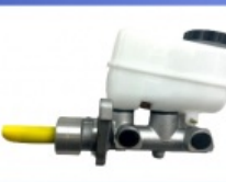
Brake Master Cylinder