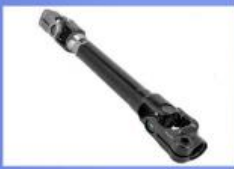
Steering Column Shaft