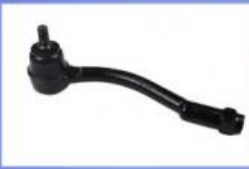
Tie Rod End